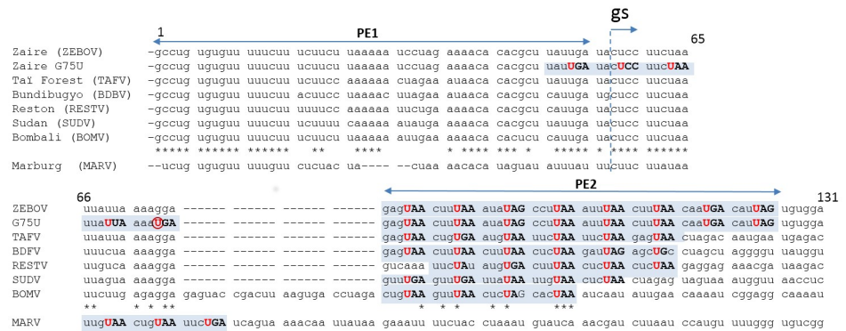
Fig 1. Filovirus bipartite promoters. This alignment of the EBOV/U7 genome 3' ends is based on the premise that genomes are assembled directly from their 5' ends, 6 nt/NP protomer, generating genome hexamer phase where only nt in hexamer positions 3, 4, and 5 point away from the protein core and can readily interact with the polymerase (underlined below). At least for ZEBOV, sequences upstream of the editing site will have different hexamer phases, e.g., 3' NNNURR for EBOV/U7 and 3' NNURRN for EBOV/U8 for the PE2 repeats. The conserved 3' URR of contiguous PE2 repeats (shaded in blue) is capitalized. The conserved U of the repeat is highlighted in red and that of G75U is circled, and asterisks below the EBOV sequences indicate their overall sequence conservation. MARV, aligned below, does not appear to have any spacer region between gs (indicated by bent arrow) and the 3 PE2 repeats. Only the ZEBOV and MARV PE2 repeats have been experimentally verified [23]. BDBV, Bundibugyo virus; BOMV, Bombali virus; EBOV, Ebola virus; gs, gene start; MARV, Marburg virus; NP, nucleoprotein; nt, nucleotides; PE1, promoter element 1; PE2, promoter element 2; RESTV, Reston virus; SUDV, Sudan virus; TAFV, Tai Forest virus; ZEBOV, EBOV Zaire.

https://doi.org/10.1371/journal.ppat.1008972.g001